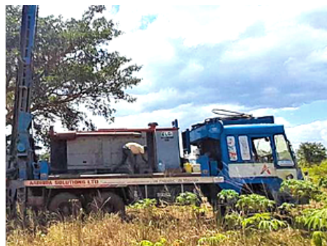
The community and school children watch as the drilling process begins.